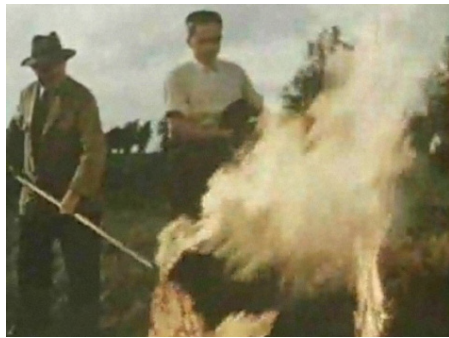
Title: Wild Oat Menace - (Video still) Date: 1955, Colour, 13:00 mins Lanbrugets Informations Kontor (Denmark)

Summary: Shows how carelessness encourages the spread of wild oats and preventive measures which can be taken. Danish commentary Museum of English Rural Life Archives, Reading, UK