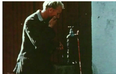
Title: Home Defence for the Farmer (Video still) Date: n.d. [1950s - 1960s], Colour, 15 mins Ministry of Agriculture, Fisheries and Food

Summary: Film shows the supposed effect of nuclear fallout on food stores through simulations of conditions Museum of English Rural Life Archives, Reading, UK