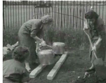
Title: Emergency Feeding - (Video still) A Training Film for Caterers Date n.d.[1939-1945] Black and white, silent, 24:30 mins Imperial Chemical Industries Ltd, The ICI film unit

Summary: Shows how carelessness encourages the spread of wild oats and preventive measures which can be taken. Danish commentary Museum of English Rural Life Archives, Reading, UK