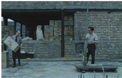
Title: Fallout (Video still) Date: n.d.[1960's] Colour, 6:55 mins Ministry of Agriculture, Fisheries and Food

Summary Film shows how to build and use emergency ovens cooking equipment.